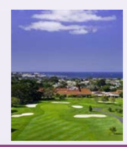
Room Rate Cut-off Date: December 31, 2014

Members are strongly encouraged to support MVCAC and its future Annual Conferences by making reservations at the Hyatt Regency Monterey.